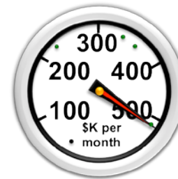
AVG FLOW RATE FROM ELCA MALARIA TO AFRICAN CHURCHES $508,326 / MONTH

Visit our website to see how we are progressing toward our goals. As of June 2013, the ELCA has raised just about $8,300,000 and our synod is reaching the half-way mark!