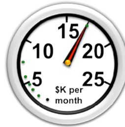
AVG FLOW RATE FROM VIRGINIA TO ELCA MALARIA $17,881 / MONTH