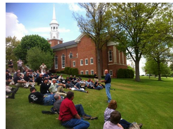
FDNY briefs responders on Sandy at LTSG

Through ELCA Disaster Response, our church is responding in areas affected by Hurricane Sandy and tornados in Oklahoma. Through our global church partnerships, we are providing basic needs such as food, water and shelter in the wake of earthquakes, tsunamis, droughts and flooding. We are working in close contact with synods, congregations and disaster response partners overseas and within the United States to meet the immediate needs of those affected by catastrophic disasters. And we will continue to help for as long as we are needed.